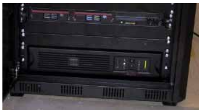
SatWise Manager (rack mounted)

The SatWise service solution combines the best Internet connectivity options for any location, with resilient hardware, networking and support.